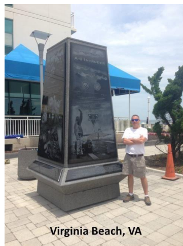
Virginia Beach, VA

All tributes have one panel dedicated to "In Memory Of".