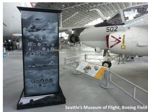
Seattle's Museum of Flight, Boeing Field