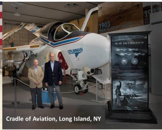
Cradle of Aviation, Long Island, NY