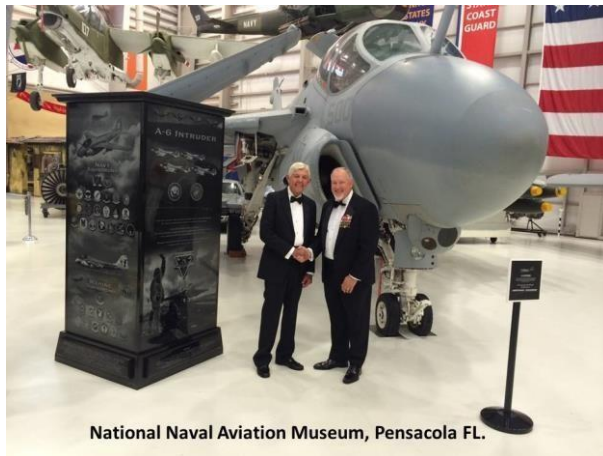
National Naval Aviation Museum, Pensacola FL.